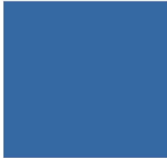
AZUL / BLUE / BLEU