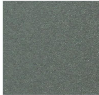
VERDE / GREEN / VERT