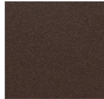
MARRÓN / BROWN / MARRON