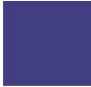
AZUL MEDIO 382