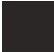
VERDE CARRUAJES 376