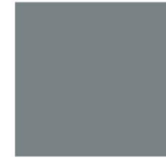
GRIS AZULADO 354