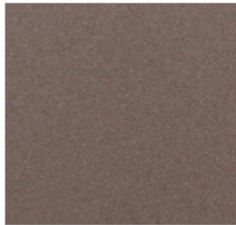
ROJO / RED / ROUGE