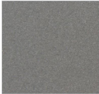
GRIS / GRAY / GRIS