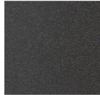
NEGRO / BLACK / NOIR