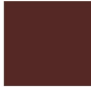
ROJO CARRUAJES 340