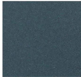
AZUL / BLUE / BLEU