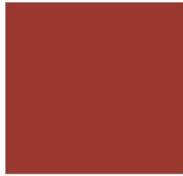
ROJO INGLÉS 331