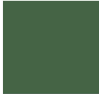
VERDE / GREEN / VERT