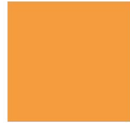
AMARILLO CANARIO 309