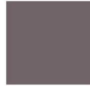
GRIS MEDIO 360