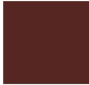
ROJO INTENSO 336