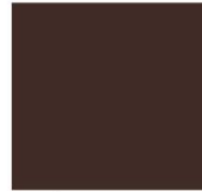
MARRÓN OSCURO 369