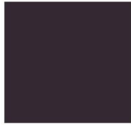
AZUL OSCURO 387