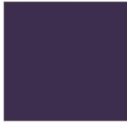
AZUL MARINO 380