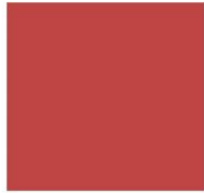
ROJO VIVO 325