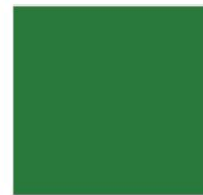
VERDE PRADO 370