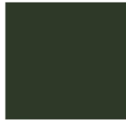
VERDE MAYO 372