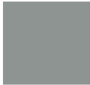
GRIS OTOÑO 358